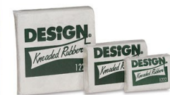
Kneaded Eraser or Sticky Tack it works as an eraser.

Tri- Tip Eraser a non-abrasive, latex-free material