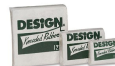
Kneaded Eraser or Sticky Tack it works as an eraser.