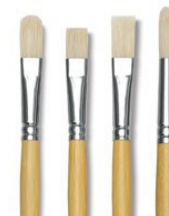
Hog Hair Bristle