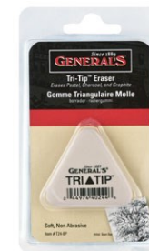
Tri- Tip Eraser a non-abrasive, latex-free material