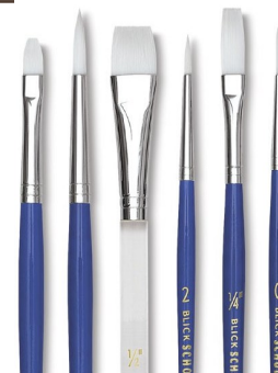
White Taklon Brushes